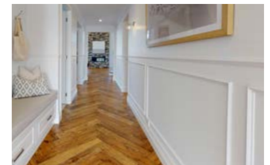
WAINSCOTING AND WALL PANELS